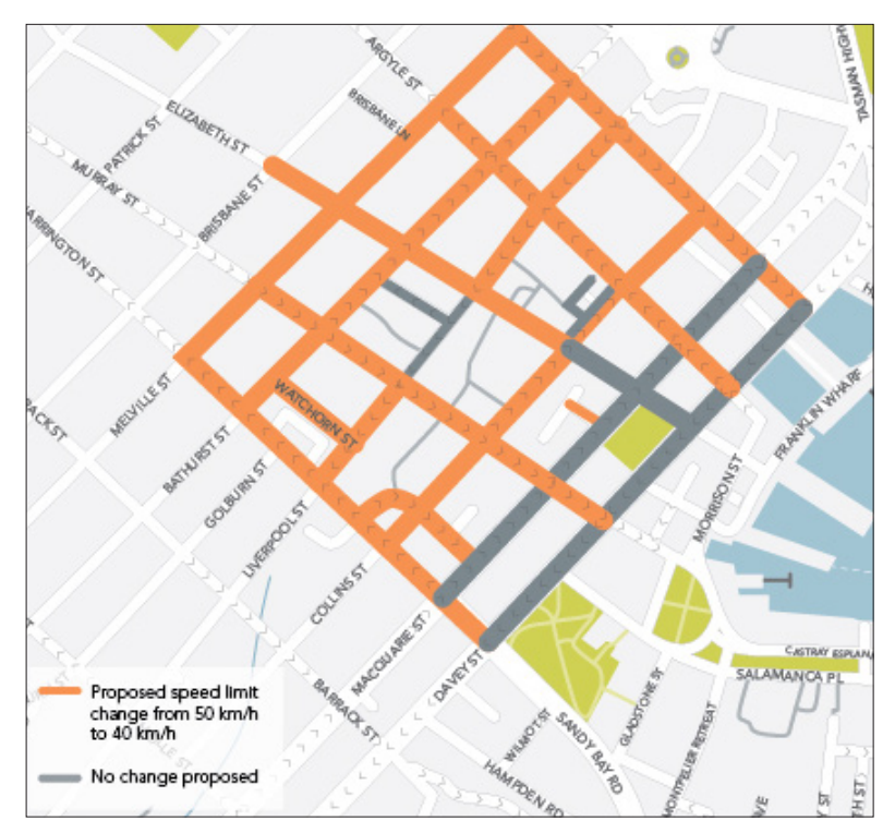
Streets that currently have lower speed limits such as the Elizabeth St Bus Mall and Liverpool St between Elizabeth and Murray sts (30 km/h) will not be changed.