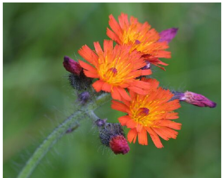
Orange hawkweed in flower

Orange hawkweed closely resembles the common lawn weeds dandelion and hawkbit but is far more invasive and can dominate pasture and native grasslands, excluding native vegetation. The plant sends out stolons (like the runners on a strawberry). Its light seeds can be blown many kilometres, so that even a single plant poses significant risk.