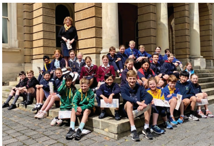
Children's Week Morning Tea (October 2020)