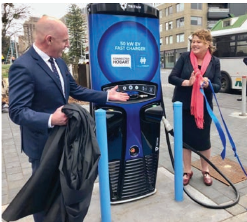
Lord Mayor Reynolds and Premier the Hon Peter Gutwein MP unveiling the fast-charge station for electric cars in Dunn Place (September 2020)