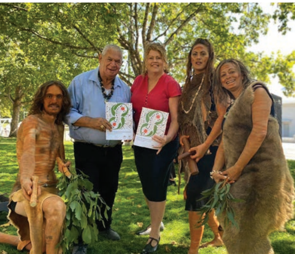
Launch of the City of Hobart Aboriginal Commitment and Action Plan (February 2020)