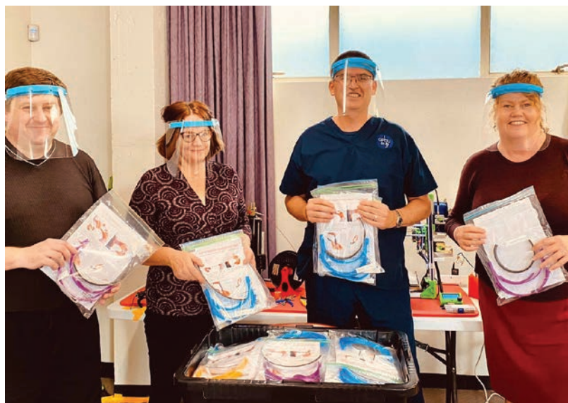
Volunteers from 3DPPE-Tas creating face masks and shields for frontline healthcare workers (April 2020)