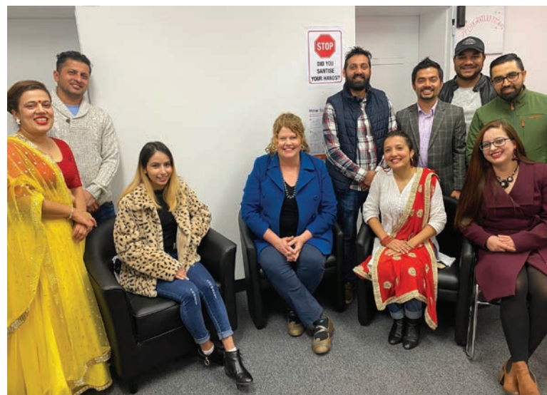
At the Nepali Society of Tasmania, Teej Photo Contest Winners (August 2020)