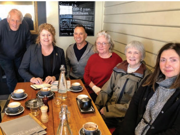
Bottom: University of Tasmania, Town and Gown graduation procession (December 2019)