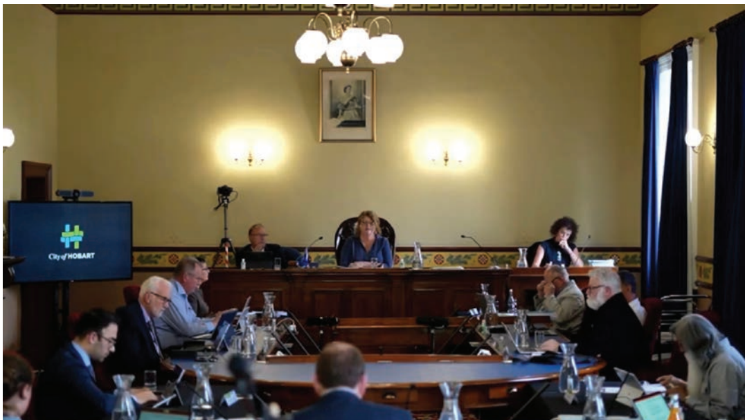
Council Meeting back in the Council Chamber post-COVID-19 (November 2020)

Lord Mayor Reynolds provided 71 media events or interviews during the year including regular appearances on ABC Breakfast after Council meetings.