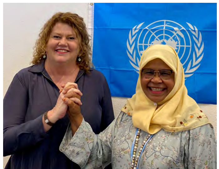
Lord Mayor Reynolds with Maimunah Mohd Sharif, former Mayor of Penang in Malaysia and now Head of UN Habitat