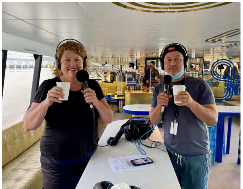
Media for launch of Council sponsored Saturday Ferry service