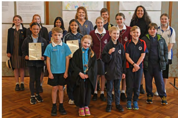
Children's Mayor submissions

12 manifestos were received from students attending a range of public and private schools within the Hobart local government area.