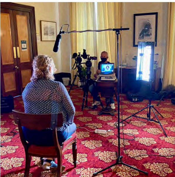
ABC TV Australia Story

While most media was local, she also appeared on national radio and TV about asylum seekers, short-stay accommodation and the William Crowther statue.