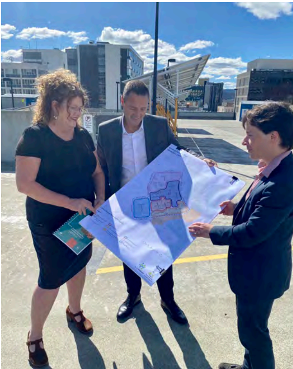
Central Hobart precinct plan

While most media was local, she also appeared on ABC TV and Channel 7 TV about the proposed Macquarie Point Stadium as well as Channel 7's Sunrise program and SBS's NITV.