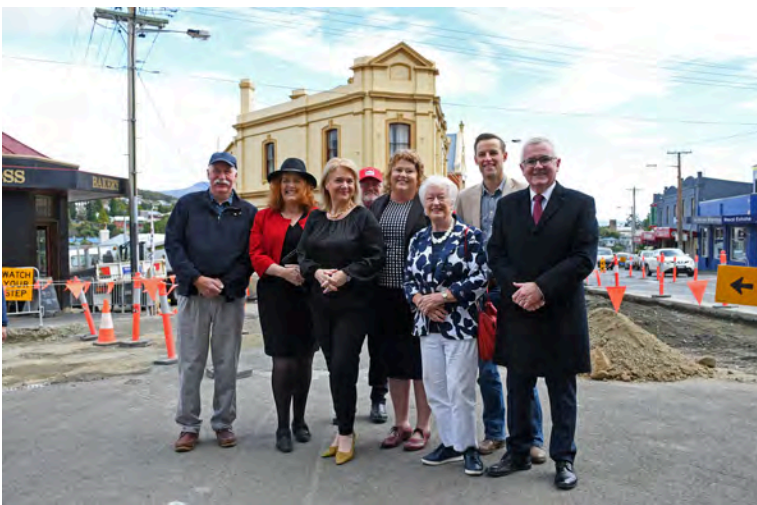
New Town Street Party

She attended three meetings of the General Management Committee this year.