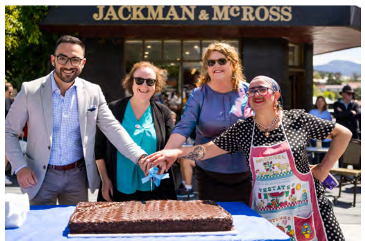
New Town Street Party