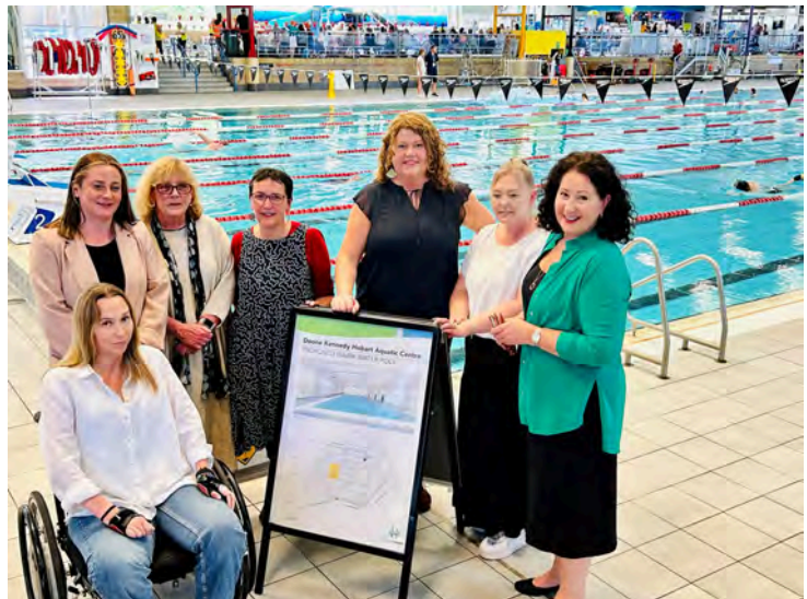
Doone Kennedy Hobart Aquatic Centre - Warmwater Pool project