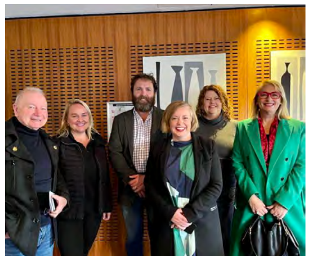
Capital City Lord Mayors meeting re climate change