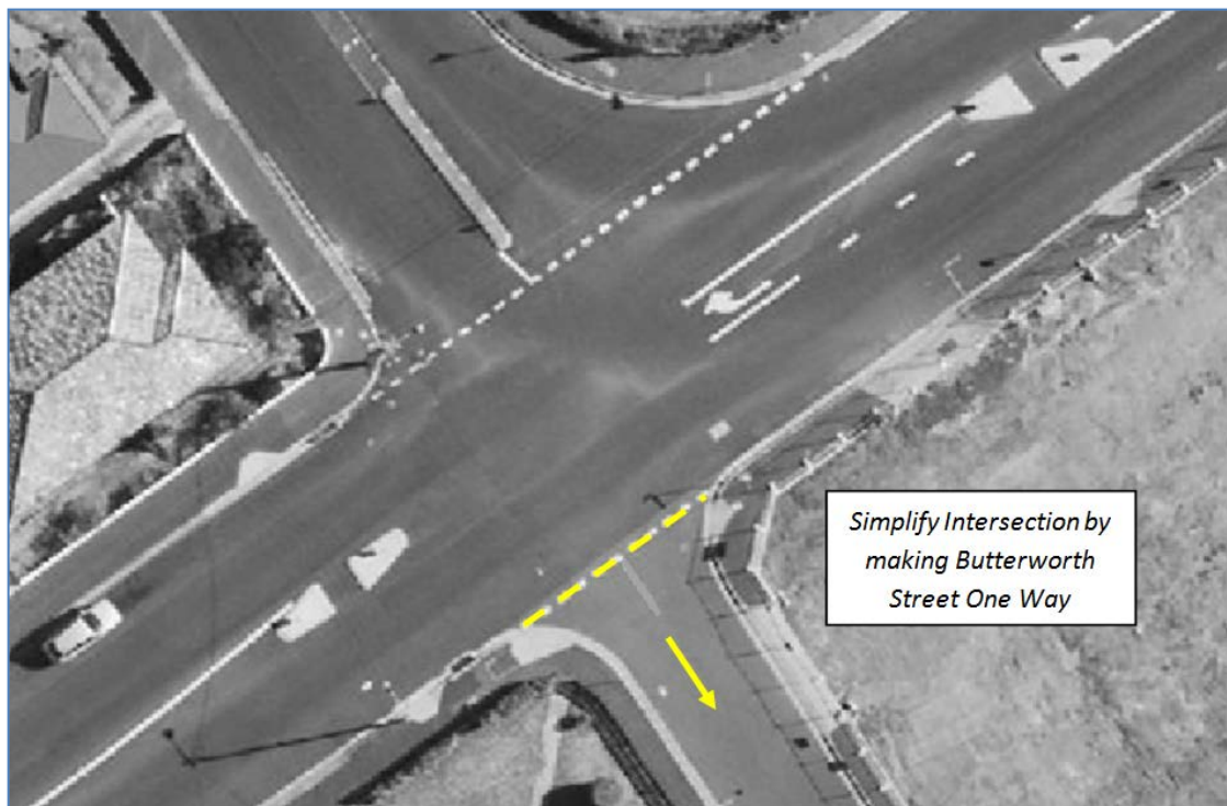
Figure 7.9 – Option H – Make Butterworth Street ‘One Way’

This option is to address the risks associated with turning movements where a driver at the intersection of Butterworth Street / Arthur Street / Mellifont Street makes an error in selecting a gap in traffic to turn into and striking another vehicle.