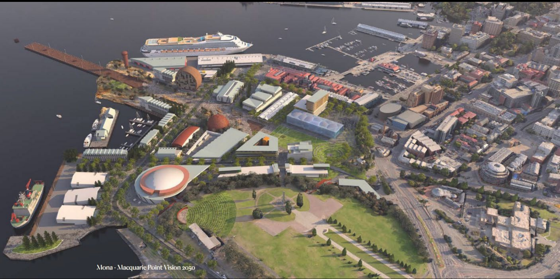
Mona - Macquarie Point Vision 2050