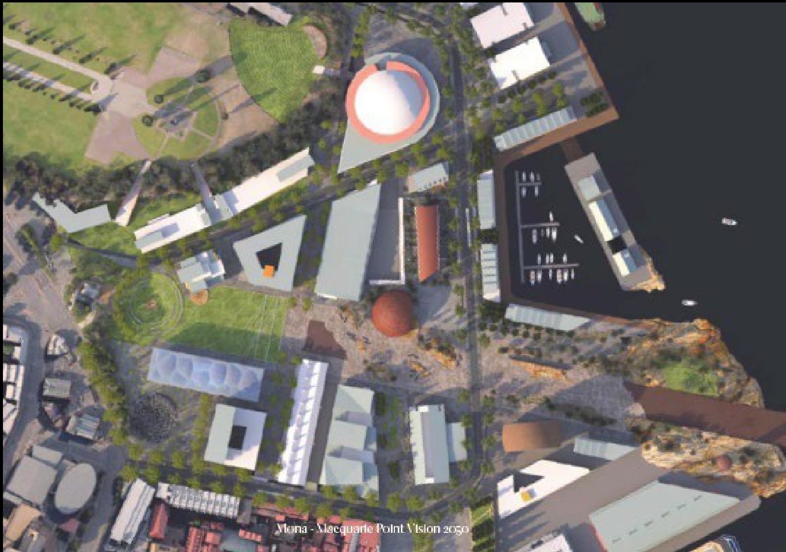
Mona - Macquarie Point Vision 2050